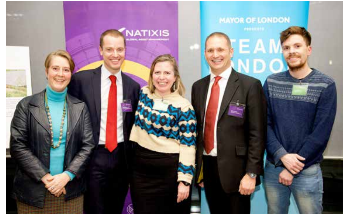
Natixis, Providence Row and Inspire! Partnership Launch, February 2015

“We are extremely proud to be Natixis Asset Management’s charity partner and already we’ve achieved a great deal together. From getting stuck in building a greenhouse on our roof garden, running marathons, supporting our annual summer event and donating computers through to advising on our strategy Natixis have really become part of the charity’s story, bringing with them a wealth of experience and skills.”