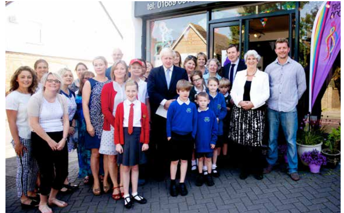
The Maypole Project, recipients of a Team London Small Innovation Grant