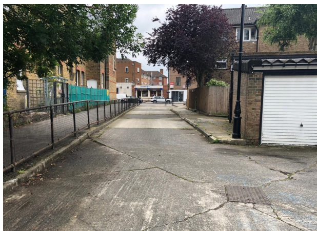
Site entrance from the northern boundary