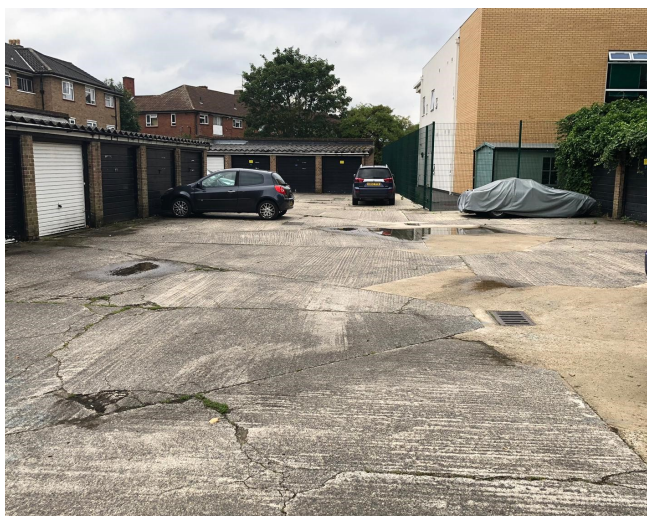
View of the site from the eastern boundary