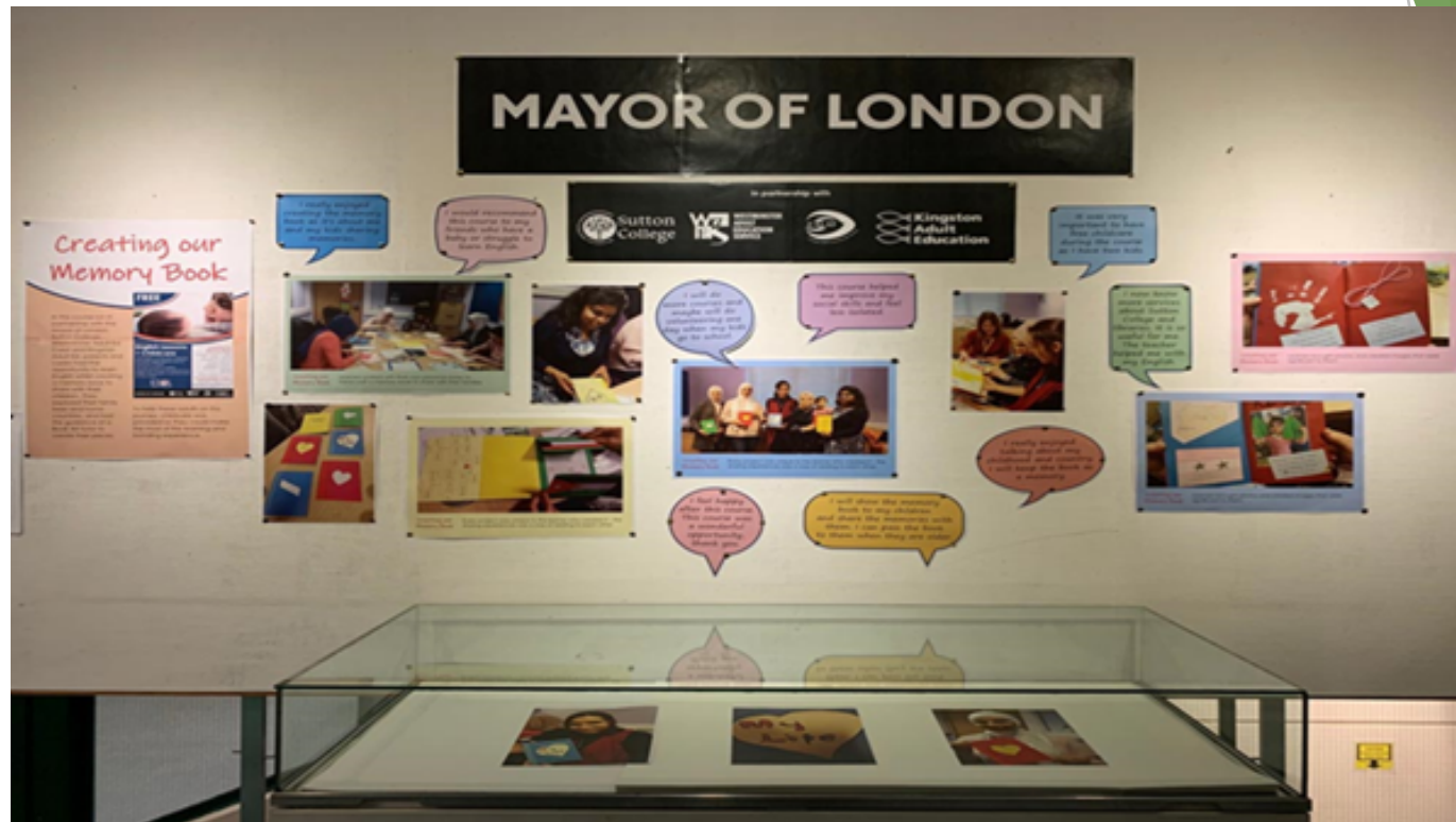
Creating our Memory book