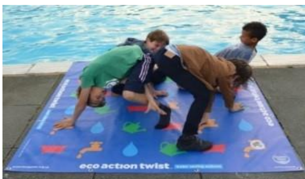
Eco action games – learning through fun

Back in 2016 the GLA won the prestigious Ashden Award for its RE:FIT programme. This came with a £10,000 prize.