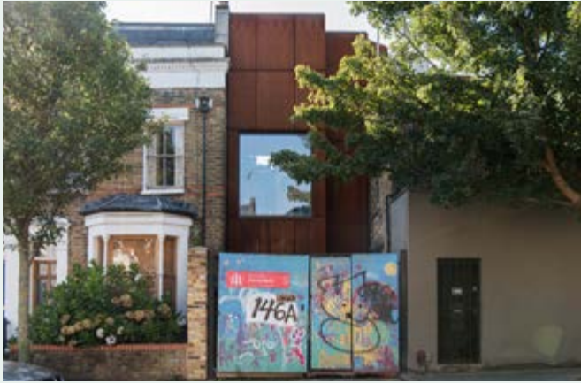
146A Rushmore Road