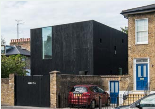
75a De Beauvoir Road