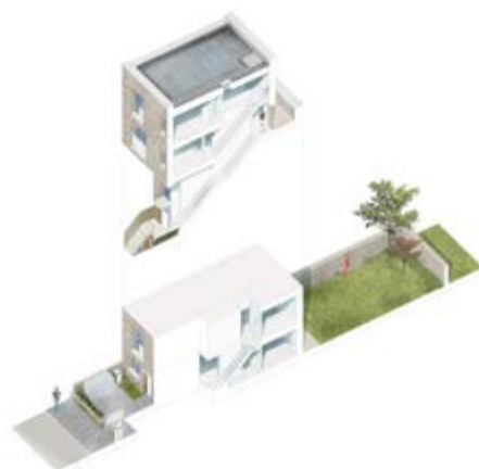
Fig 103 Stacked maisonettes - the reinvention of this post-war format is being used as way of increasing the density of the typical terraced street typology (Allies and Morrison)

Credit: Allies and Morrison and the figures are extracts from Hackney Characterisation Study