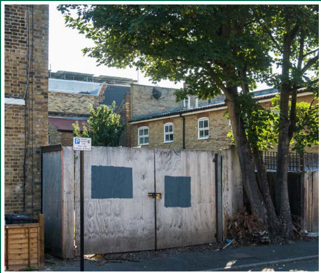
Google Street View of Balcorne Street