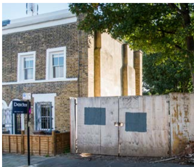
28 - 42 Balcorne Street