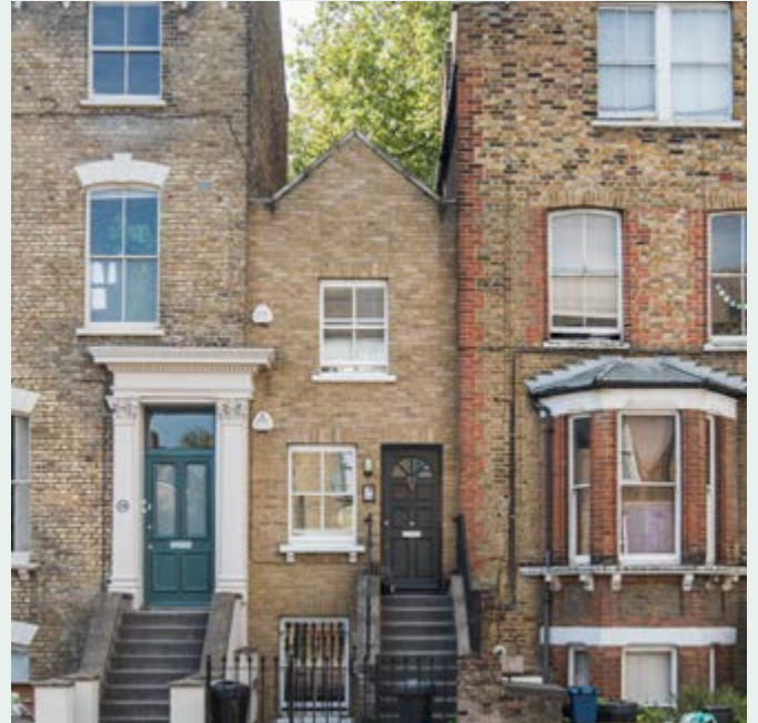
72 Sandringham Road