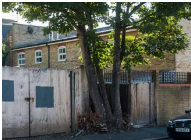
25-35 Balcorne Street. The fence for Orchard School is adj to No. 25

The residential buildings on either side of the site, plus 28 - 42 Balcorne Street facing the front of the site are two storeys, therefore any proposal should take into consideration these existing buildings. 25-35 Balcorne Street could be late Georgian/early Victorian terrace, whilst the terraces of 28 - 42 Balcorne Street, and 41- 45 Balcorne Street were more recently constructed, most likely between the 1980s and 1990s.