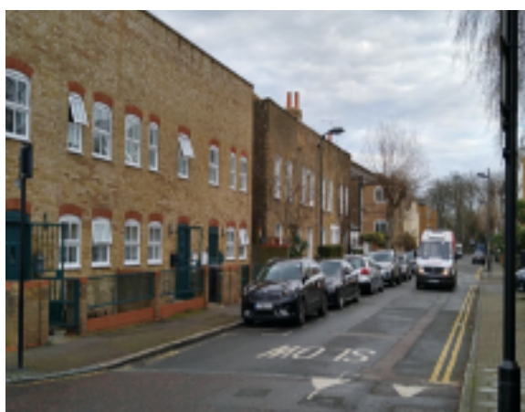
41 - 45 Balcorne Street borders the southern boundary of the site. Nos. 47 - 55 date from an early period.