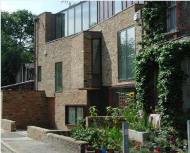
Two infill houses, Stoke Newington