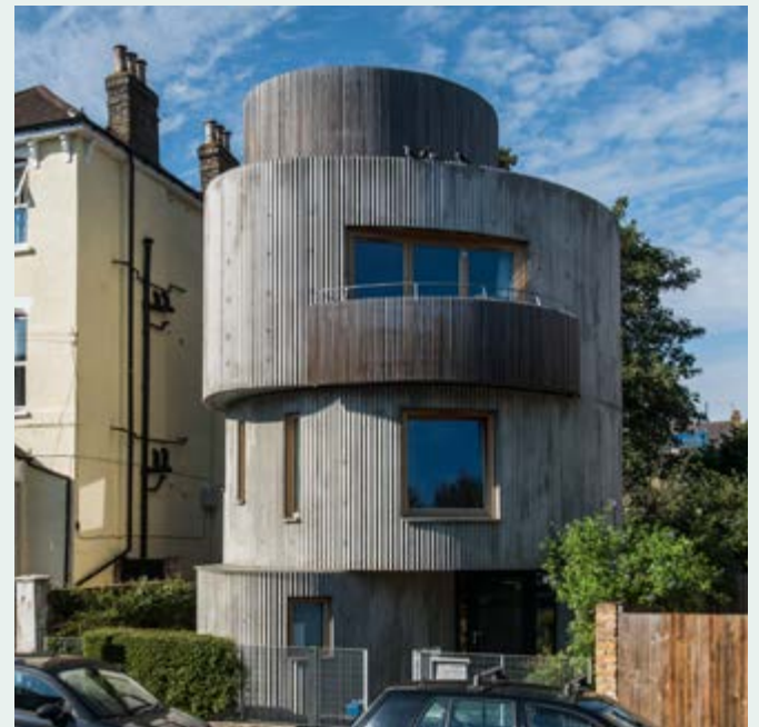
83 Maury Road