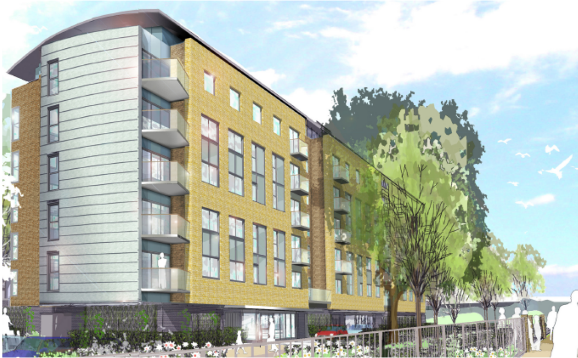
Block 7: located along Harrow Manor Way *