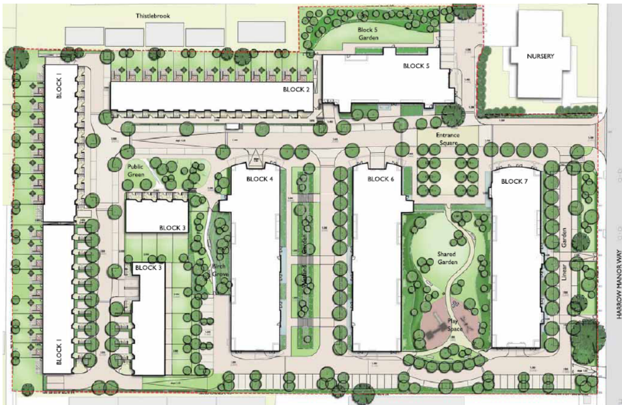
Fig 2: Proposed distribution of open amenity/children's play space within the site *

35 Policy 3D.13 of the London Plan sets out that "the Mayor will and the boroughs should ensure developments that include housing make provision for play and informal recreation, based on the expected child population generated by the scheme and an assessment of future needs." Using the methodology within the Mayor's supplementary planning guidance 'Providing for Children and Young People's Play and Informal Recreation' it is anticipated that there will be approximately 180 children within the development. The guidance sets a benchmark of 10 sq.m of useable child play space to be provided per child, with under-5 child play space provided on-site. As such the development should make provision for 1,800 sq.m. of play space.