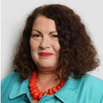
Leonie Cooper AM Chair of the Economy Committee

Sadiq Khan Mayor of London (Sent by email)