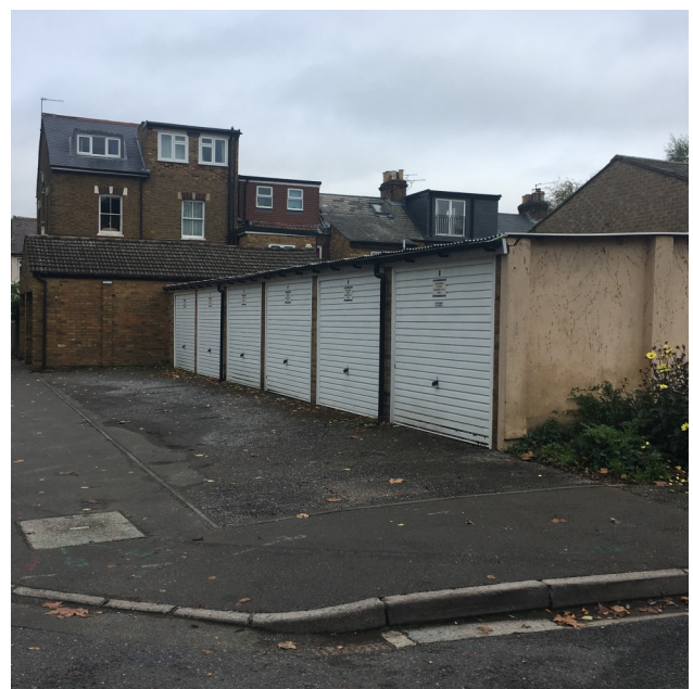
View of the site from Carrick Close