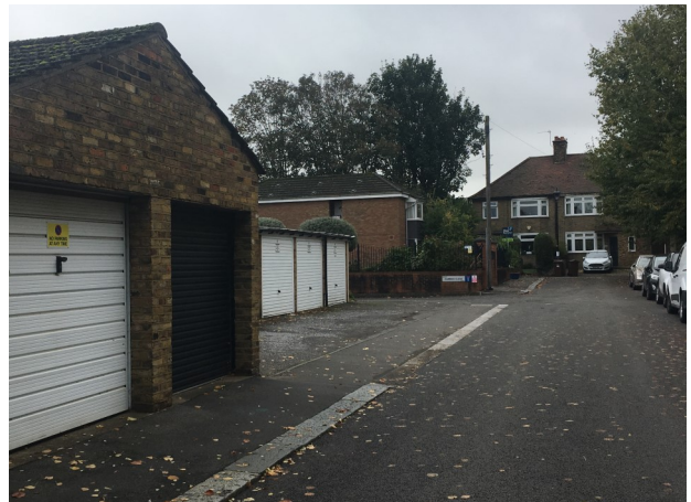
View of the site from Byfield Road