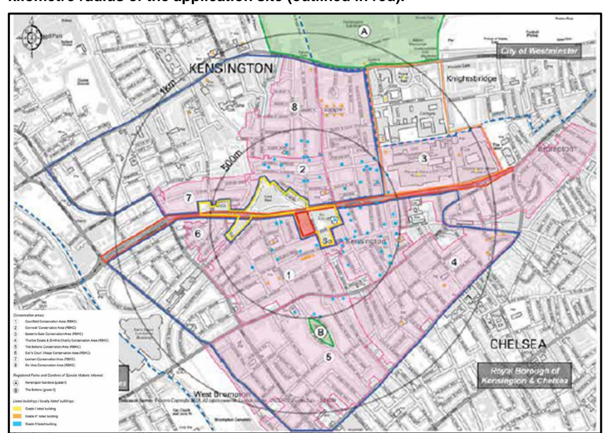
Figure 4: Conservation Areas, listed buildings (within a 500-metre and RPGHSI within 1-kilometre radius of the application site (outlined in red).