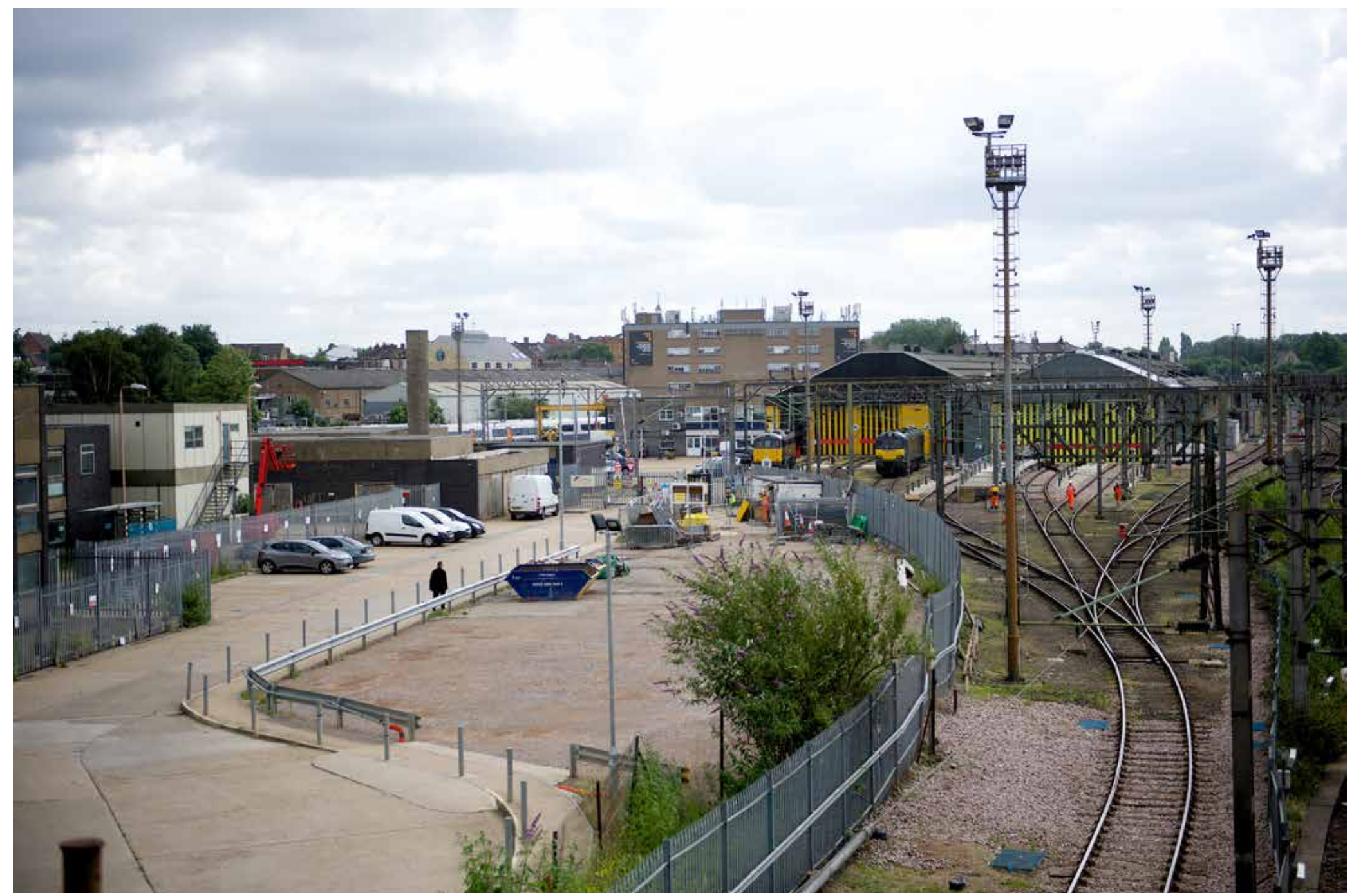
View of the Train Maintenance Depot at Willesden Junction looking east