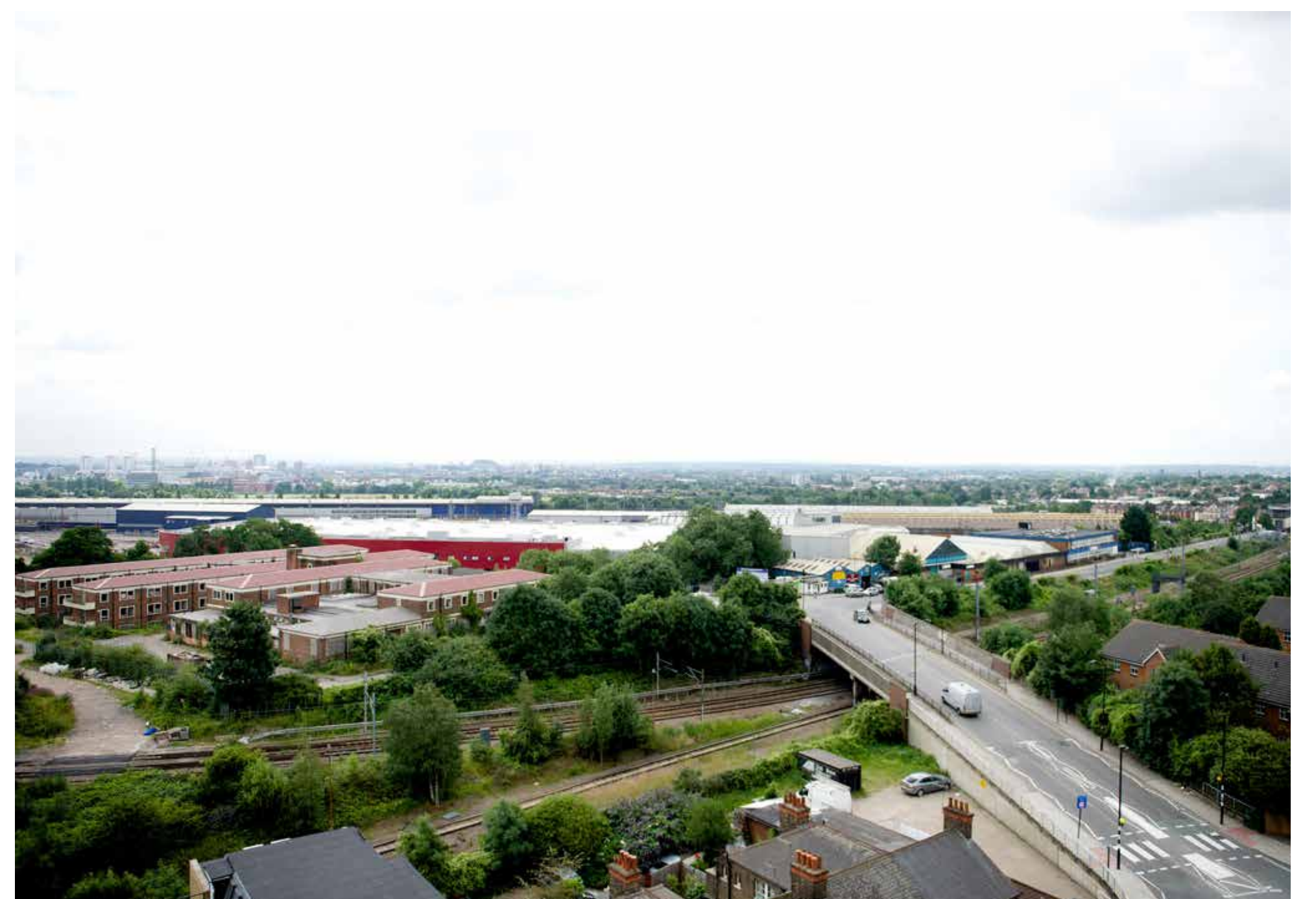
View of Old Oak South looking south east