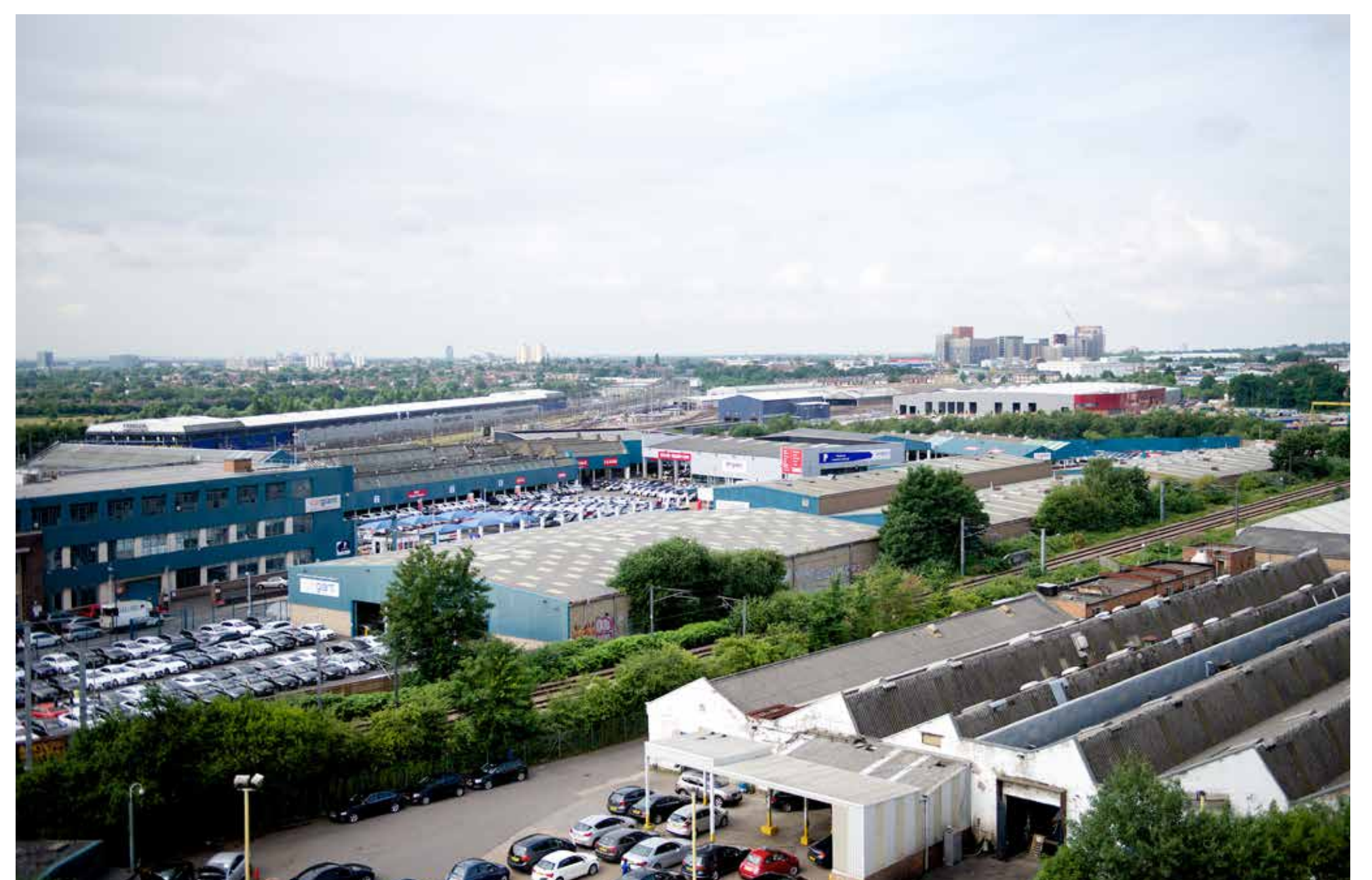
View of Old Oak North looking south west