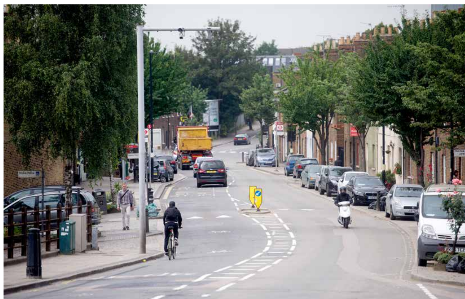
View of Old Oak Lane looking south