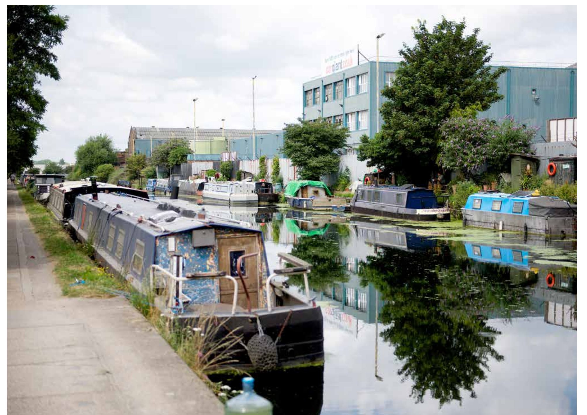
View of the Grand Union Canal looking west to Old Oak North