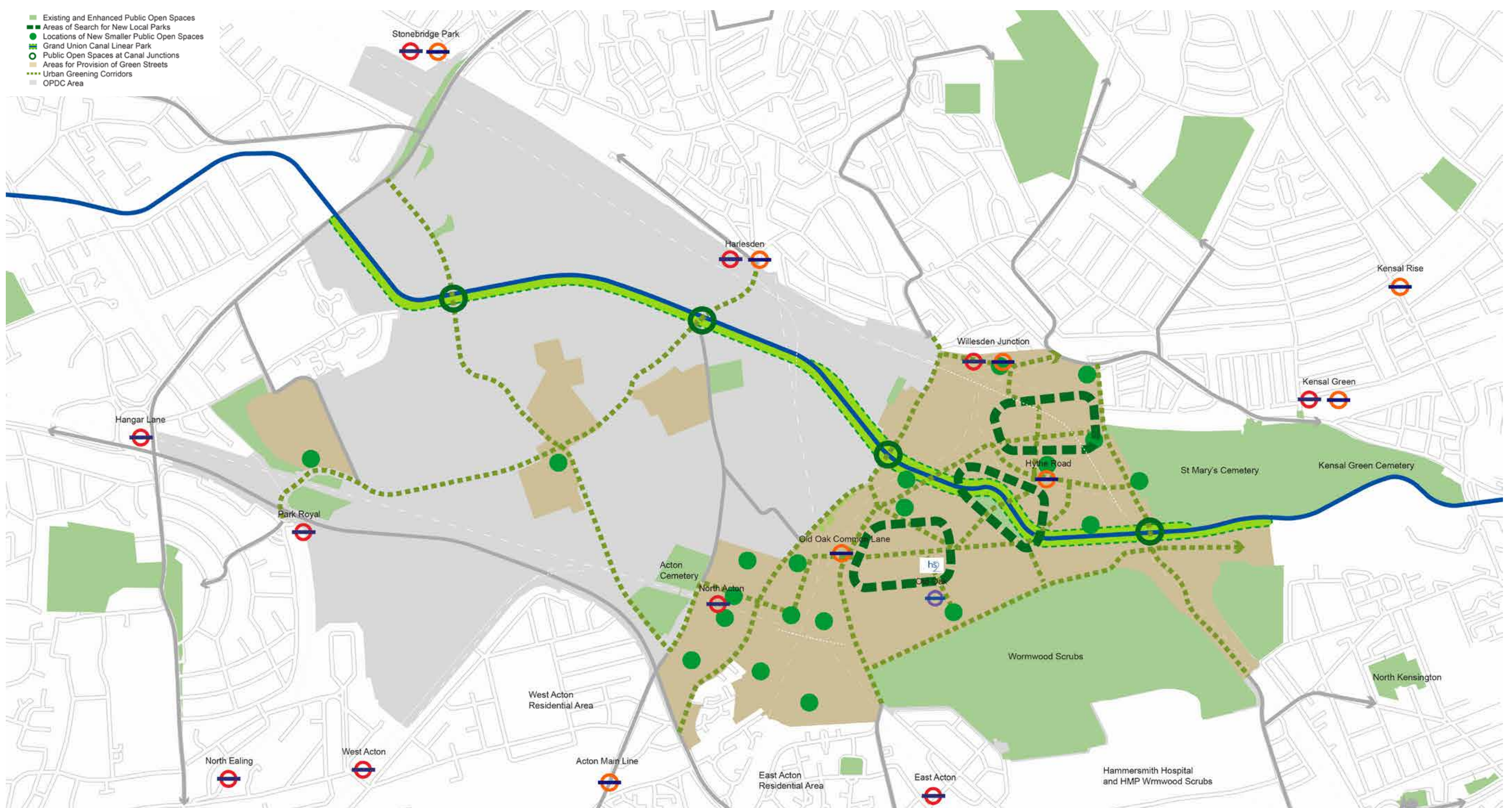
Policy SP8: map of existing and proposed green infrastructure and open