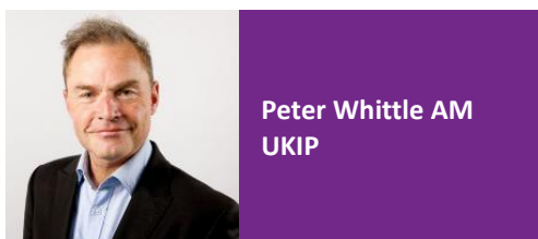
Peter Whittle AM UKIP

At the Annual Meeting of the Assembly on 13 May 2016, the Assembly agreed the formation of a working group to undertake an investigation into the recent Mayoral and London Assembly elections in order to assess issues arising during the voting and counting process and to make recommendations to encourage best practice at future elections. This is the Panel's report.