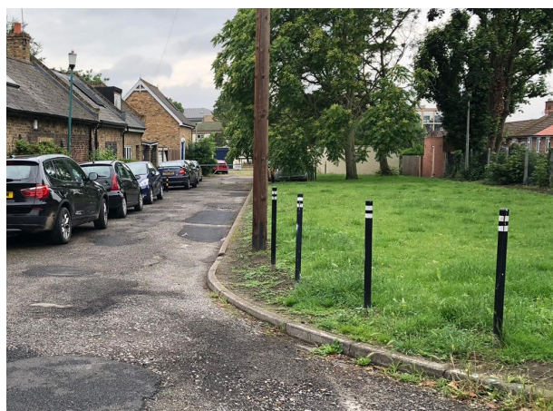
Entrance of the site from Upper Butts