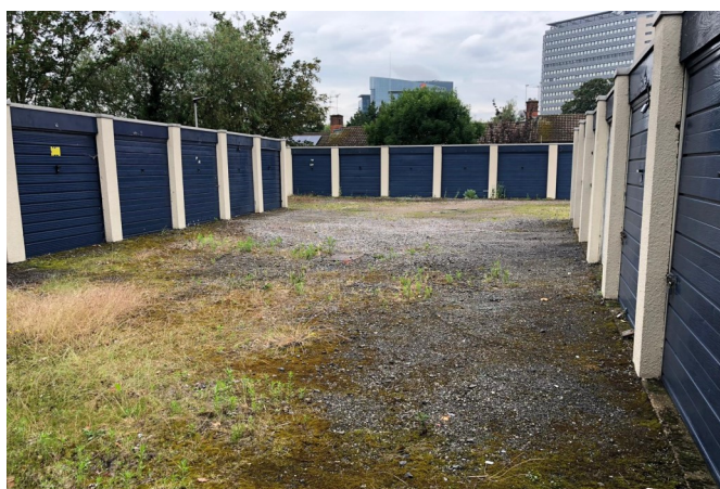
View of the site from the southern boundary