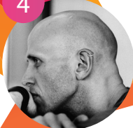
Big Dance Trafalgar Square 2012 – Wayne McGregor CBE