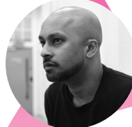
Big Dance Trafalgar Square 2016 – Akram Khan