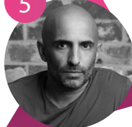
Big Commonwealth Dance 2014 – Beats for Peace – Rafael Bonachela