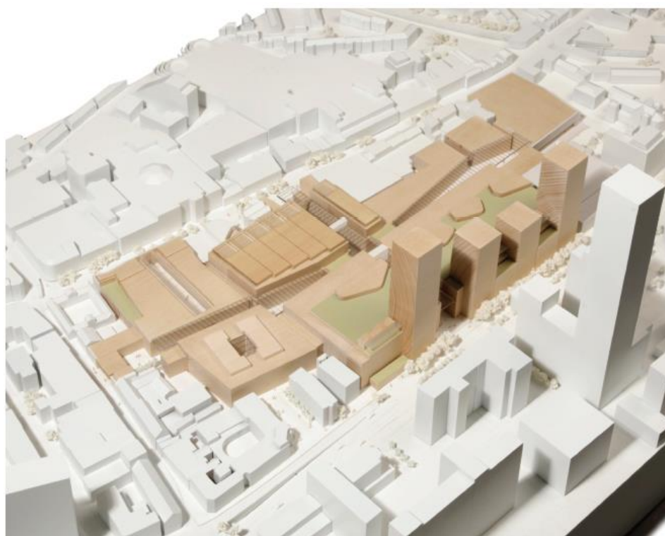
Illustrative scheme model, viewed from the south-east

126 The application proposes a new mixed-use shopping centre in the Croydon Town Centre. The scheme is well designed and arranged to provide a high quality retail and leisure destination with good quality residential space.