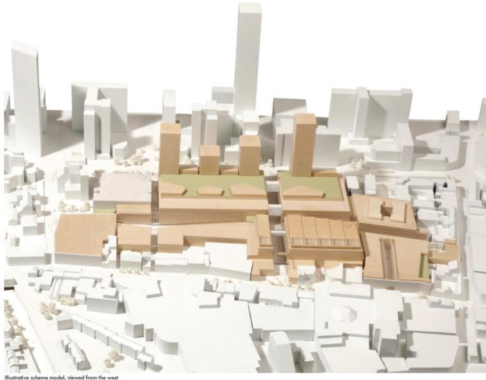
Fig 4: Illustrative model showing an indicative layout looking east from Old Town