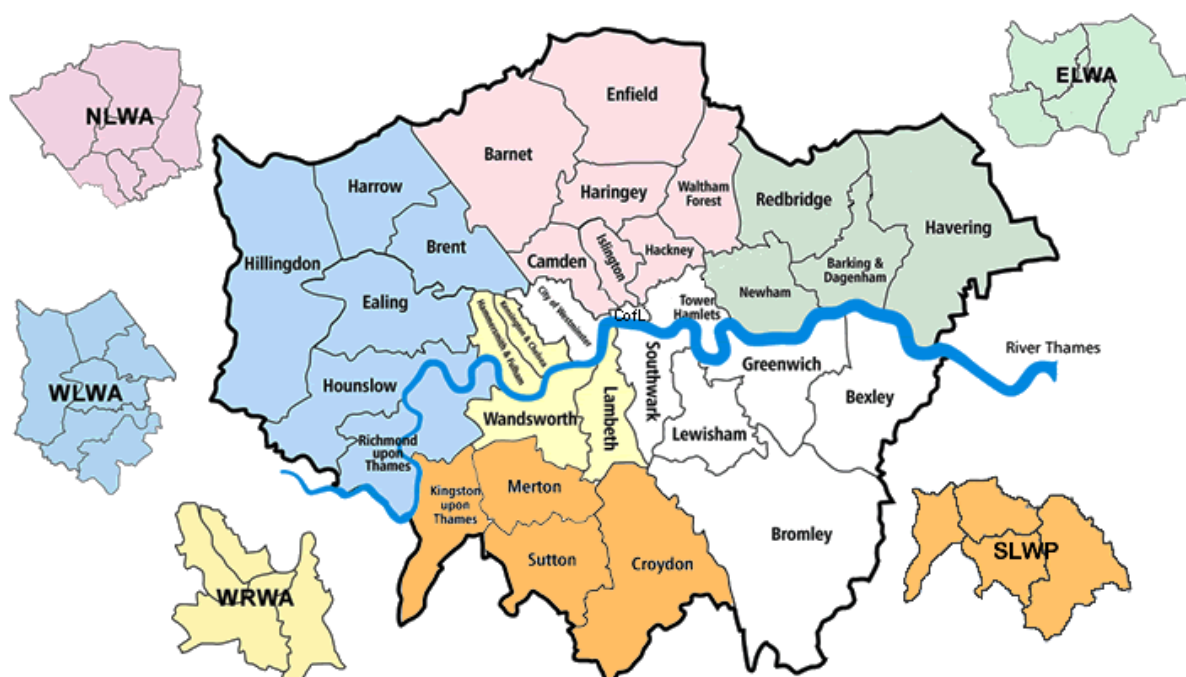
Figure 1: Map of London Boroughs

1.1.2 For OPDC, the Technical Paper only includes the land within the OPDC boundary which falls within LBHF. The remainder of the OPDC's land falls within the London Boroughs of Brent and Ealing which are part of the West London Waste Authority (WLWA) and Waste Plan (WLWP), therefore these parts of OPDC are not part of the WRWA and not within the scope of this study.