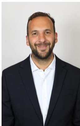
Zack Polanski AM