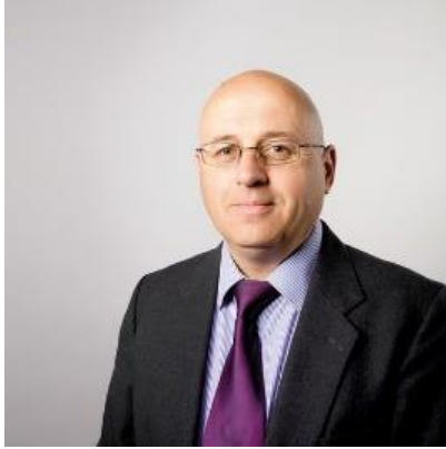
Keith Prince AM Chairman of the Transport Committee

Sadiq Khan Mayor of London (Sent by email)