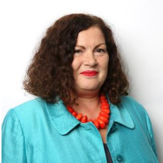
Leonie Cooper AM Chair of the Environment Committee

Sadiq Khan Mayor of London (Sent by email)