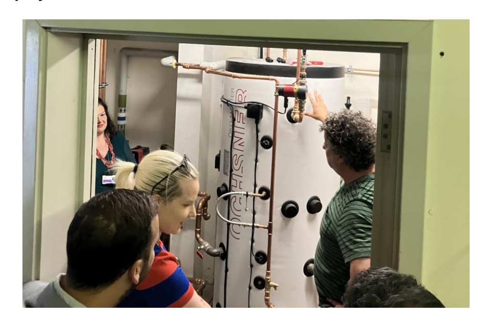
Figure 3: Members of the Committee and Stokey Energy inspect the air source heat pump system in the Clubhouse