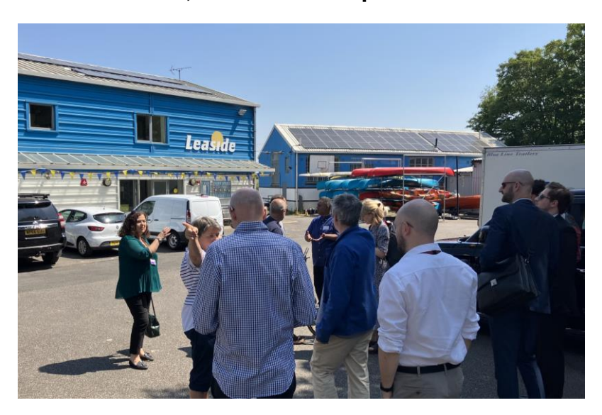
Figure 2: The Leaside Trust, with new solar panels visible on two roofs

Built in approximately 2004, the Leaside's main building (the Clubhouse) is a steel frame structure. Before retrofitting, it was a highly inefficient building with lightweight steel cladding; the airtightness of the ground-floor spaces was particularly poor. The Trust wanted to increase the amount of space for community activities; lower its carbon footprint; and reduce its energy bills through retrofitting. In 2022, the organisation's estimated bills went from £2,400 to £18,000.<sup>56</sup> The Leaside Trust has a five-year environmental strategy, which aims to decarbonise and engage the local community about the importance of climate action.<sup>57</sup>