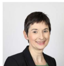
Caroline Pidgeon MBE AM Liberal Democrats