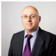
Keith Prince AM Conservatives