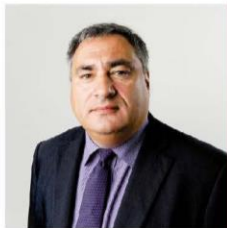
Len Duvall OBE AM Labour