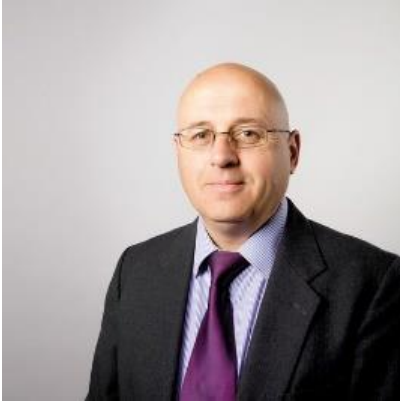
Keith Prince AM Chairman of the Transport Committee

Sadiq Khan Mayor of London (Sent by email)