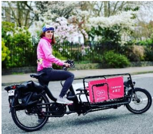
Figure 1: models of cargo bikes and micro-electric vehicles