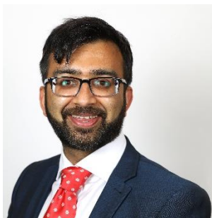
Krupesh Hirani AM Chair of the Health Committee

Sadiq Khan Mayor of London (Sent by email)