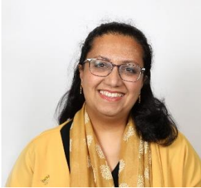
Hina Bokhari AM Chair of the Economy Committee

Sadiq Khan Mayor of London (Sent by email)