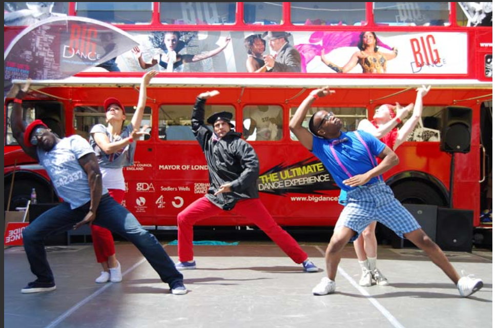
Big Dance Bus at Islington