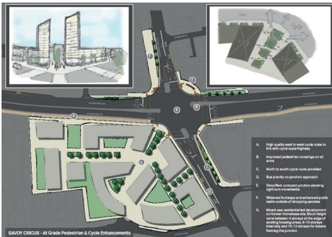
At grade option at Savoy Circus

A package of potential at-grade junction enhancement schemes was also assessed. The schemes included introducing 2-way working at Hanger Lane and bus and cycle only links to Old Oak Common at Gypsy Corner and Savoy Circus. These options were designed to meet corridor objectives for reduced severance and an improved environment and are much more affordable at approximately £5m-£25m per location.