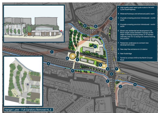
Short tunnel option at Savoy Circus