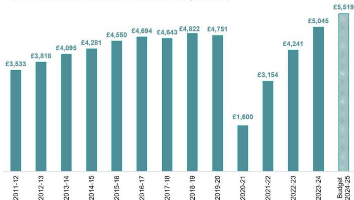
TfL total fares income, 2011-12 to 2024-25 (millions)