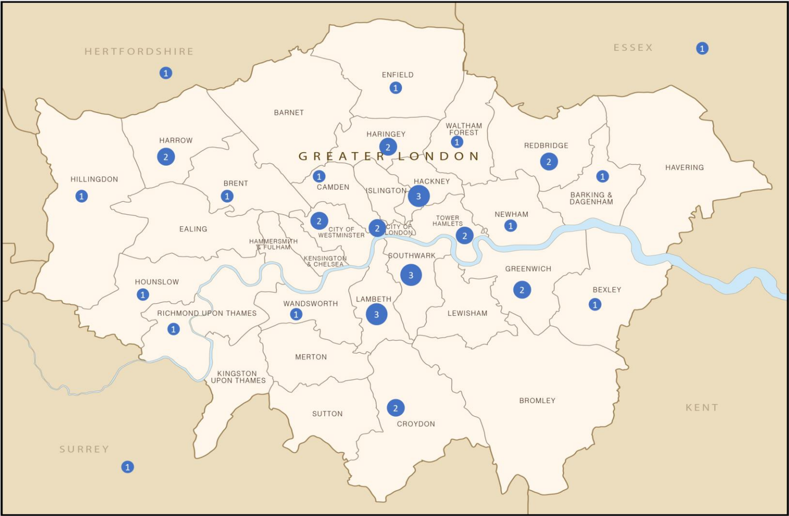
Figure 3 – Location of provider headquarters 5