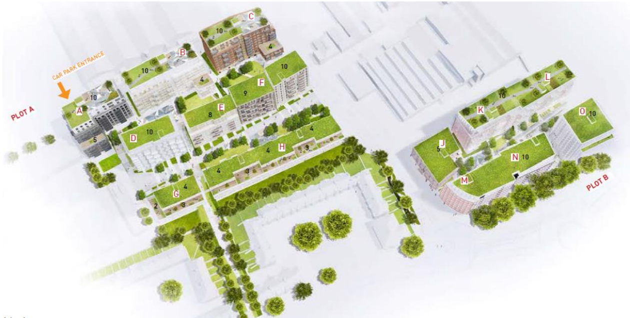
Figure 1: Proposed massing (taken from DAS revised addendum December 2018)

20 The development would comprise eleven buildings, across two development Plots. Plot A comprising buildings A to H is laid out on a broad street-based pattern, with spines of amenity and play space for future residents of the scheme in between. Plot B, comprising buildings J to O, sit upon a commercial podium, with the exception of Building O which is a standalone building in the south-east corner of the plot. All buildings in Plot B are residential above ground floor level with the exception of Building O which is residential above first floor. The single storey podium would provide amenity and playspace for the residents living in the proposed development.