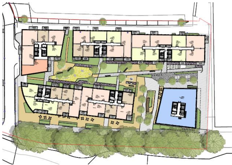
Figure 3: Proposed first floor plan - Plot B (taken from 10046-A-DRG-Z2-G100-2001-PL-RS Rev C)

23 As shown in Figure 3 below, the podium level of Plot B will comprise amenity space for future residents which would be accessed from five residential cores, corresponding to the residential buildings J to N. The proposed buildings are arranged in a broad perimeter block fashion, with the buildings ranging from five to ten storeys in height, including the podium level.