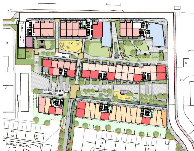
Figure 2: Proposed ground floor plan - Plot A (taken from 10046-A-DRG-Z0-G100-2000-PL-RS Rev E)

21 Plot A is predominantly residential in nature, comprising a mixture of one, two and three bed flats, and three and four bedroom townhouses. Building B accommodates 338 sq.m. of creche space (Use class D1/D2) at ground floor and Building C accommodates 496 sq.m. of community space (Use Class D1/D2) at ground floor. Plot B accommodates 3,097 sq.m. of B1 workspace at podium level and 183 sq.m. of flexible retail (Use class A1-5). Buildings J to N above the podium are residential.