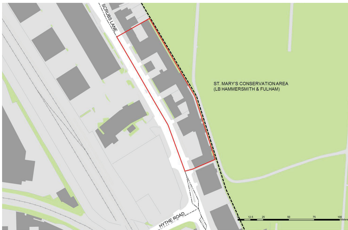
Figure 1: Proposed Cumberland Park Factory Conservation Area boundary