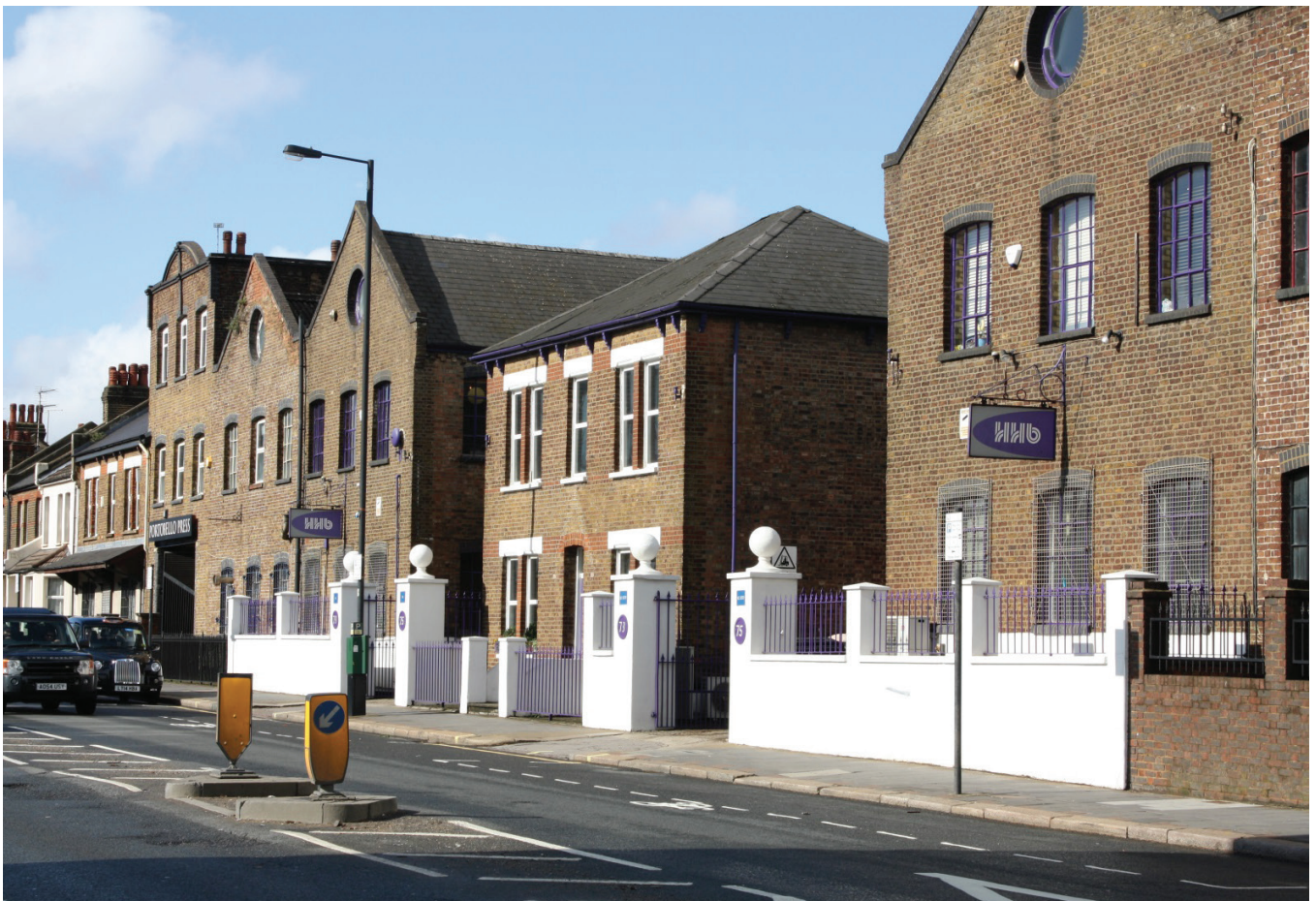
Figure 5: Street frontages

5.13. The proposed area and the immediate