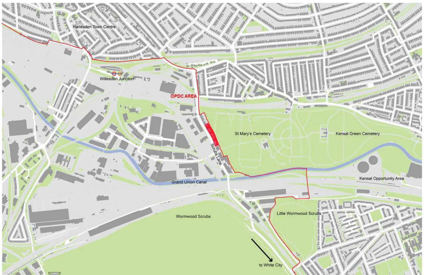
Figure 2: Wider urban context

4.3 The construction of the Grand Union Canal in 1801 and the railway network from 1838 supported a variety of industries within this area, including manufacturing and chemical processing, which grew up alongside the transport network, sustained by railway sidings, canalside wharfs and improved road links.