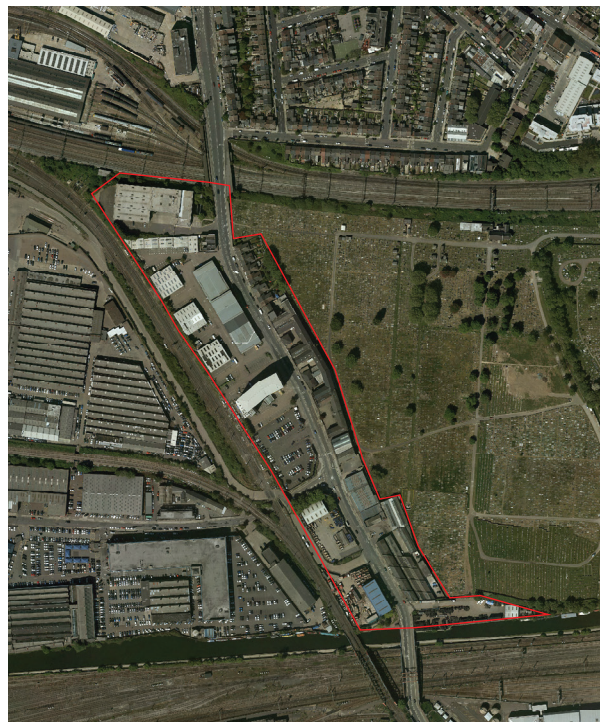
Aerial photo of Scrubs Lane

they are not considered to merit inclusion within the designation.