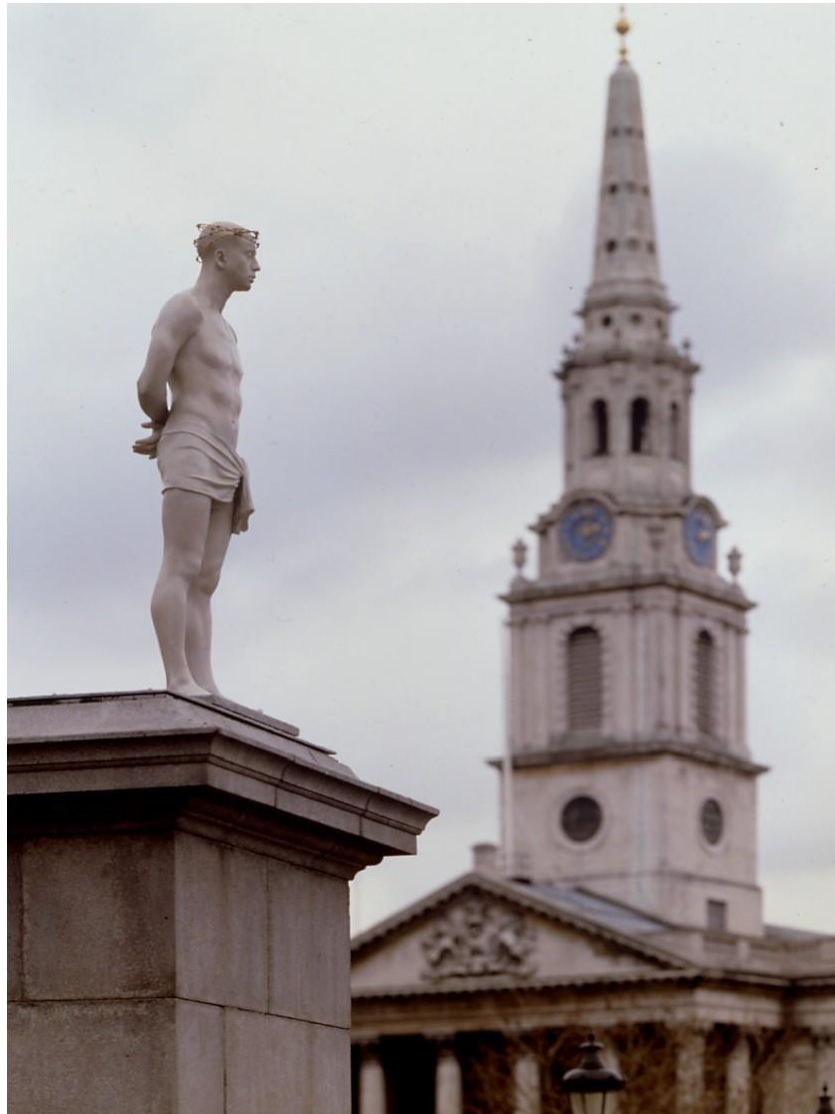
Mark Wallinger Ecce Homo 1999