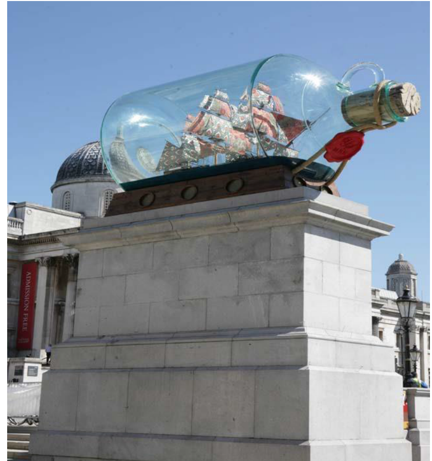
Yinka Shonibare Nelson's Ship in a Bottle 2009