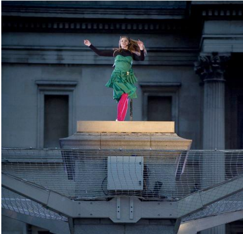
Antony Gormley One and Other 2009