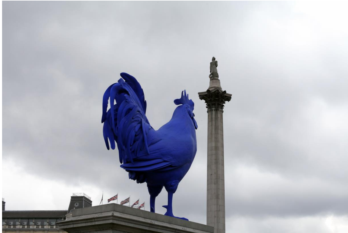
Katharina Fritsch Hahn / Cock 2013