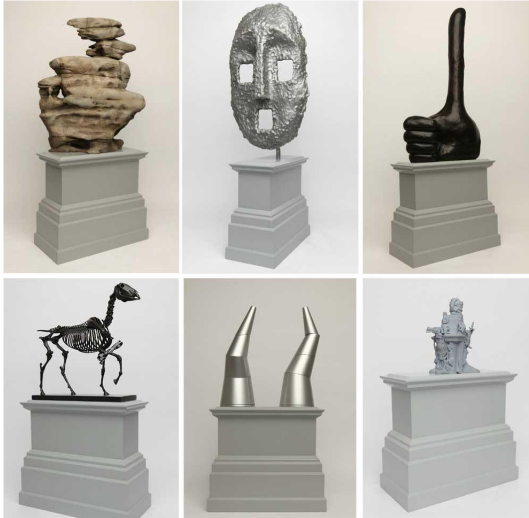
Top, left to right: Marcus Coates, 'Unmade Monument' , Ugo Rondinone, 'MOON MASK', David Shrigley , 'Really Good' Bottom, left to right: Hans Haacke, 'Gift Horse', Liliane Lijn, 'The Dance', Mark Leckey, 'Larger Squat Afar'