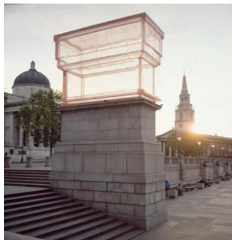
Rachel Whiteread Monument 2001