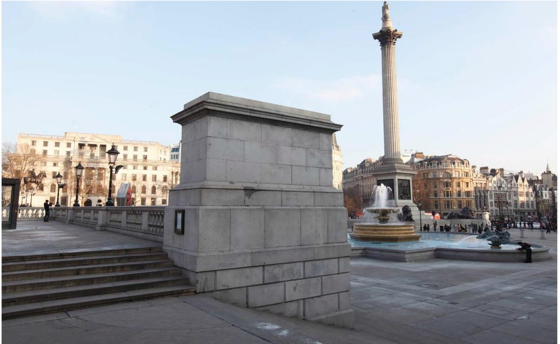
The Fourth Plinth, empty in Trafalgar Square