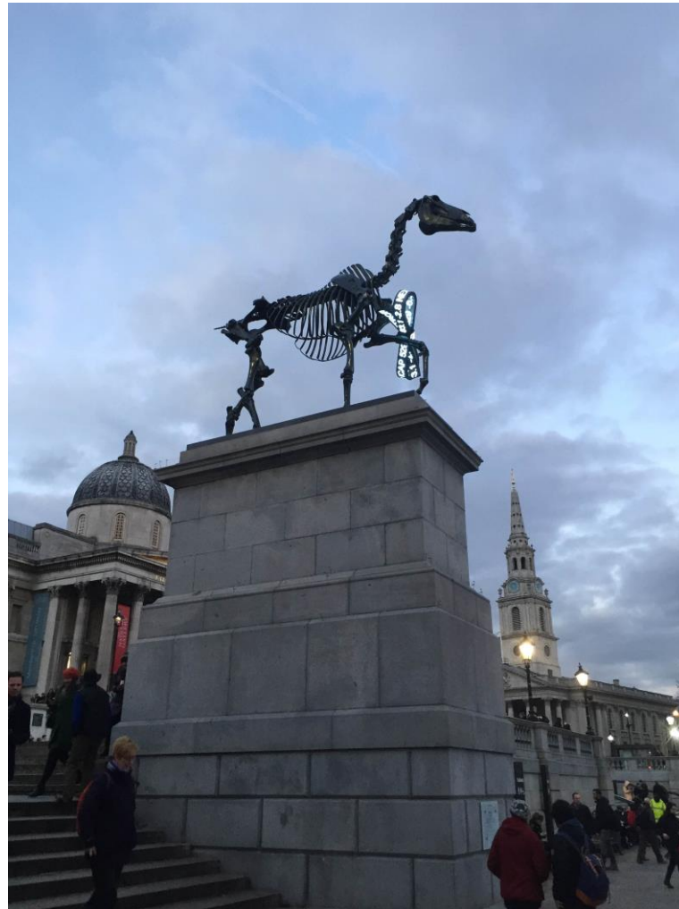
Hans Haacke Gift Horse 2015