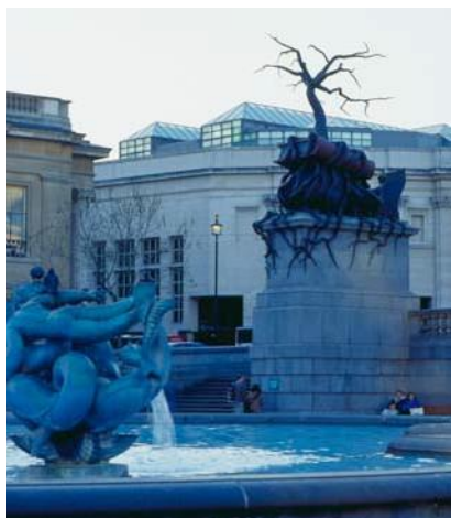
Bill Woodrow Regardless of History 2000