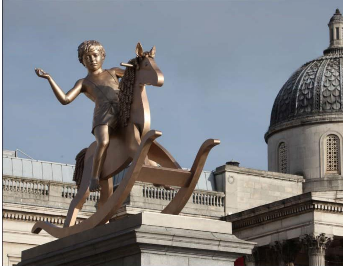
Elmgreen & Dragset Powerless Structures, Fig. 101 2012