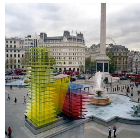
Thomas Schütte Model for a Hotel 2007