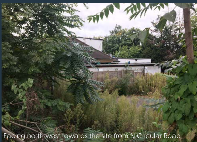
Facing north west towards the site from N Circular Road

TfL have provided a planning statement on the site which can be viewed on the GLA Small Sites marketing portal.