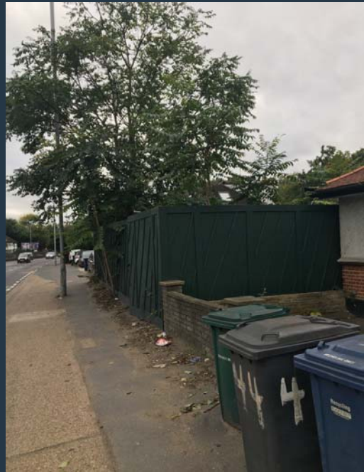
Facing south west towards the site from N Circular Road

We are seeking unconditional offers and / or subject to planning offers via informal tender. All bids should be submitted on a specific bid proforma available on the GLA Small Sites marketing portal and emailed to BrentmeadPlace@london.gov.uk by 12 noon on Friday 23rd March 2018.