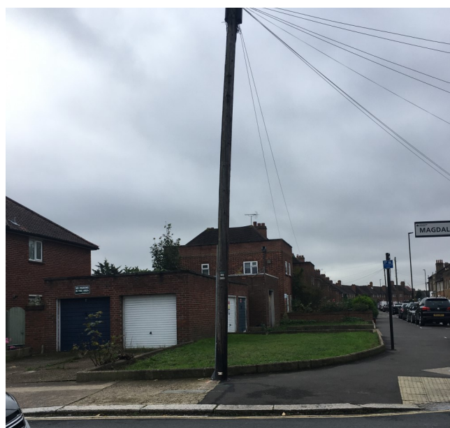
View of the site from Magdala Road