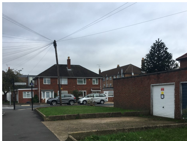
View of the site from the southern boundary