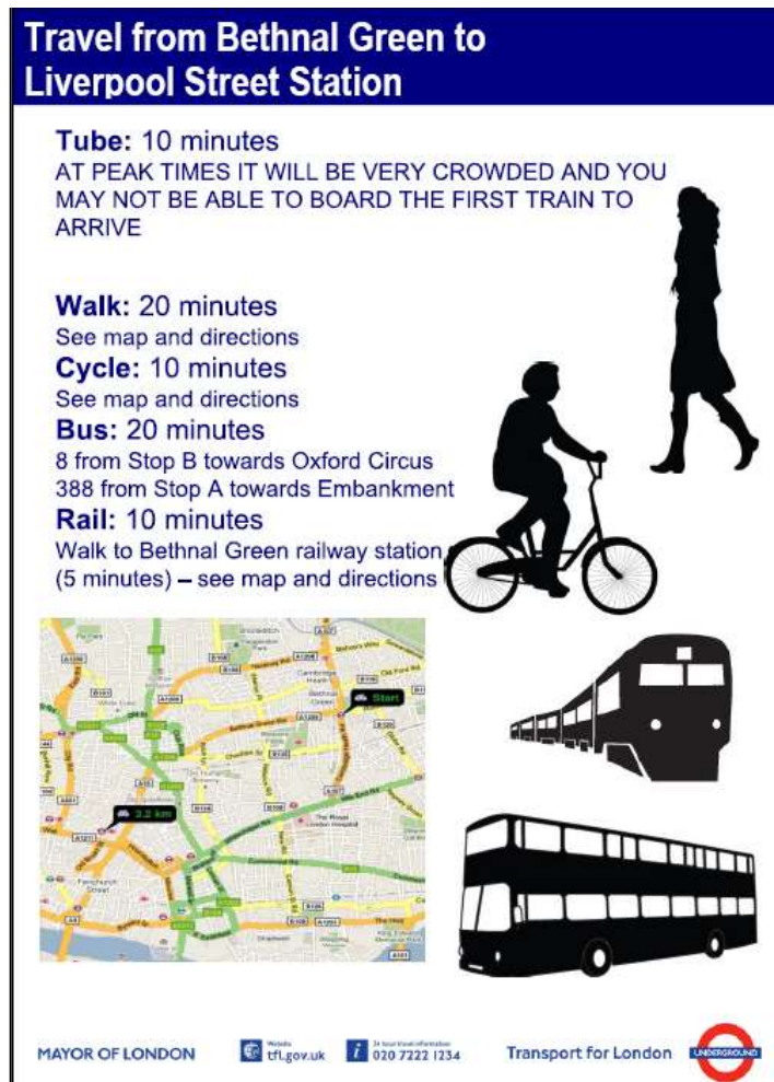
Figure 3: Simplified mock-up of signs outside stations with information about alternative routes to popular destinations. In the final design, the map would need to be enhanced to indicate specific walking and cycling routes and the locations of relevant bus stops.

In its report back to the Committee on enhanced station information, London Underground should include details of a refreshed training programme.