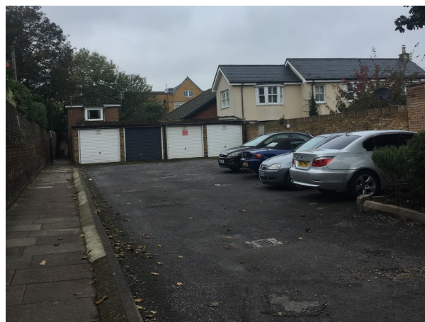
View of the site from Algar Road