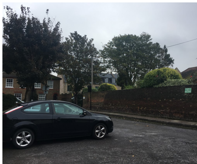
View of the site from its north west corner