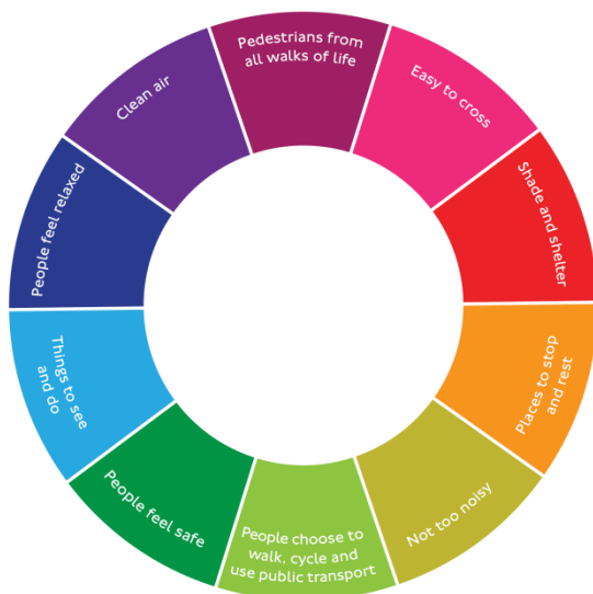
Figure 10.1 - The Ten Healthy Streets Indicators

10.2.8 The Mayor has a long-term vision to reduce danger on the streets so that no deaths or serious injuries occur on London's streets. This Vision Zero will be achieved by designing and managing a street system that accommodates human error and ensures impact levels are not sufficient to cause fatal or serious injury. This will require reducing the dominance of motor vehicles and targeting danger at source.