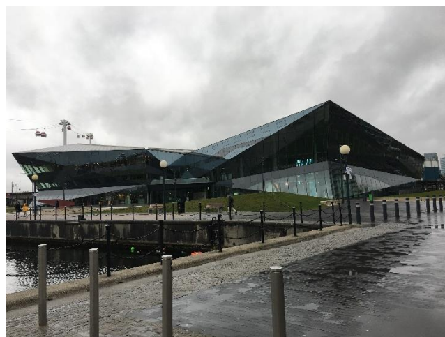
The Crystal Front Elevation