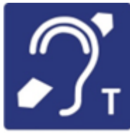
Hearing induction loop

Accessible viewing area: Our event has an accessible viewing area for the main stage performances. This area is for people who use wheelchairs or find it hard to stand for long periods. Companions are welcome to join, and chairs are provided.