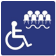
Accessible spectator area

Who is it for? Everyone is welcome at our event, whether you are young or old, coming with family and friends, or joining us on your own.