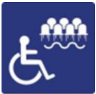
Accessible spectator area

Who is it for? Everyone is welcome at our event, whether you are young or old, coming with family and friends, or joining us on your own.