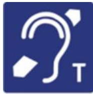
Hearing induction loop

Accessible viewing area: Our event has an accessible viewing area for the main stage performances. This area is for people who use wheelchairs or find it hard to stand for long periods. Companions are welcome to join, and chairs are provided.