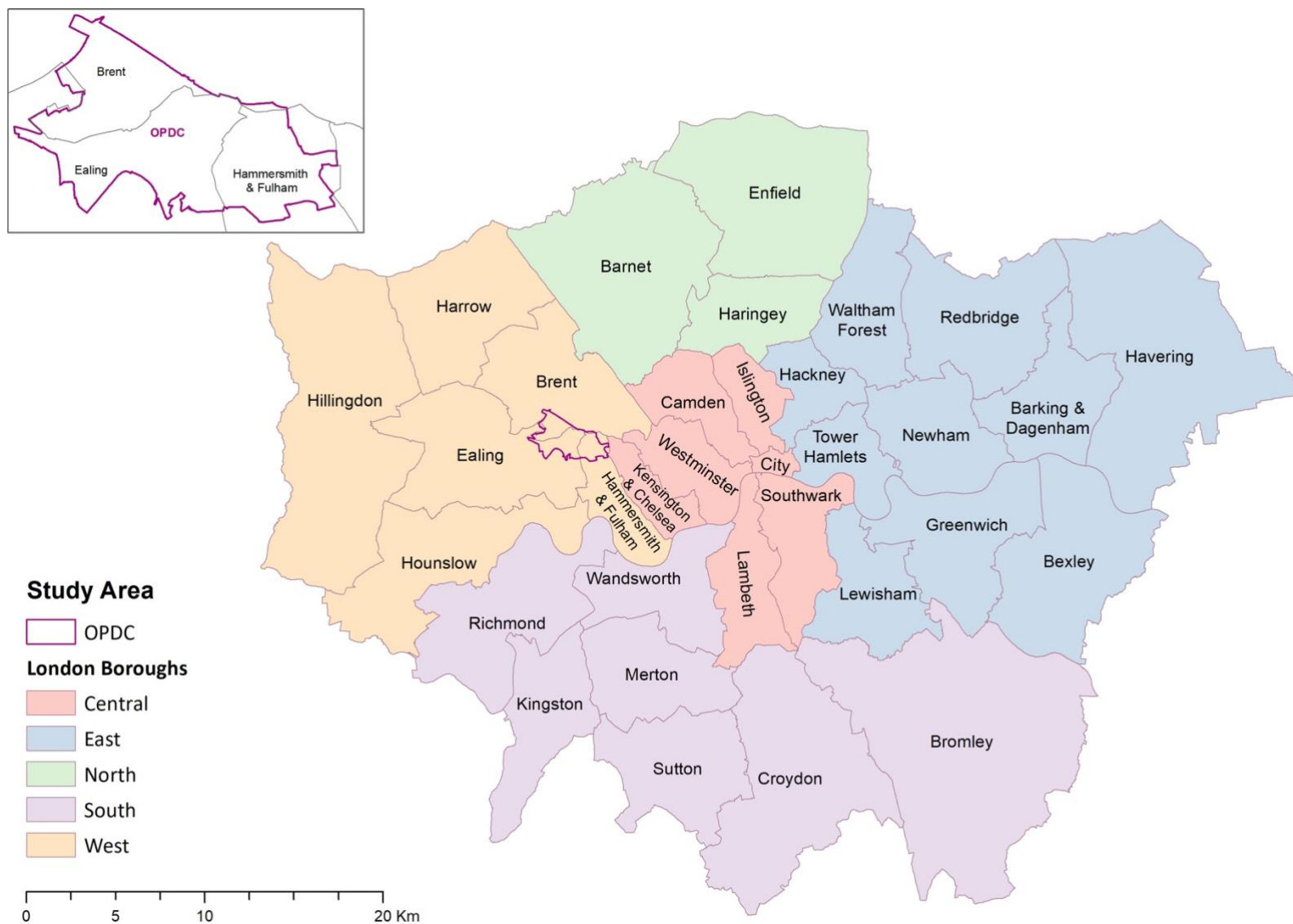
Figure 1.1 Study area