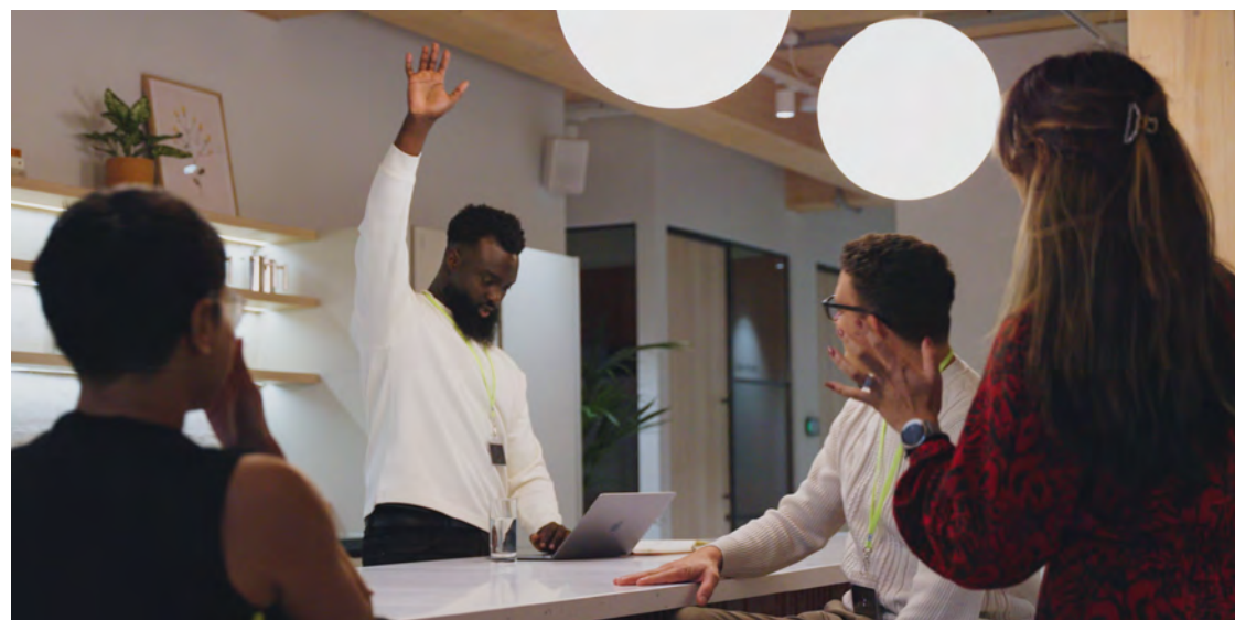
Catch22 participants and staff