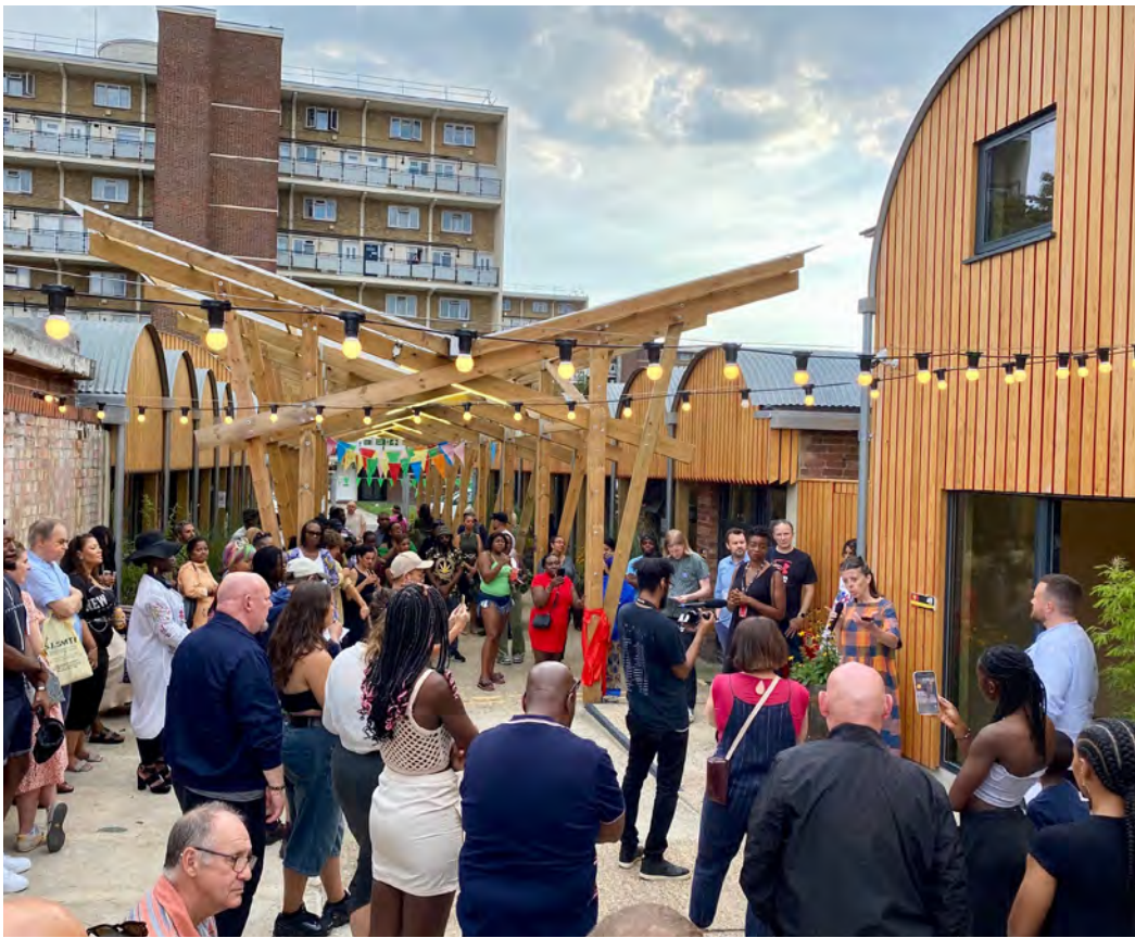
Angel Yard, Edmonton supported by Communities & Place funding