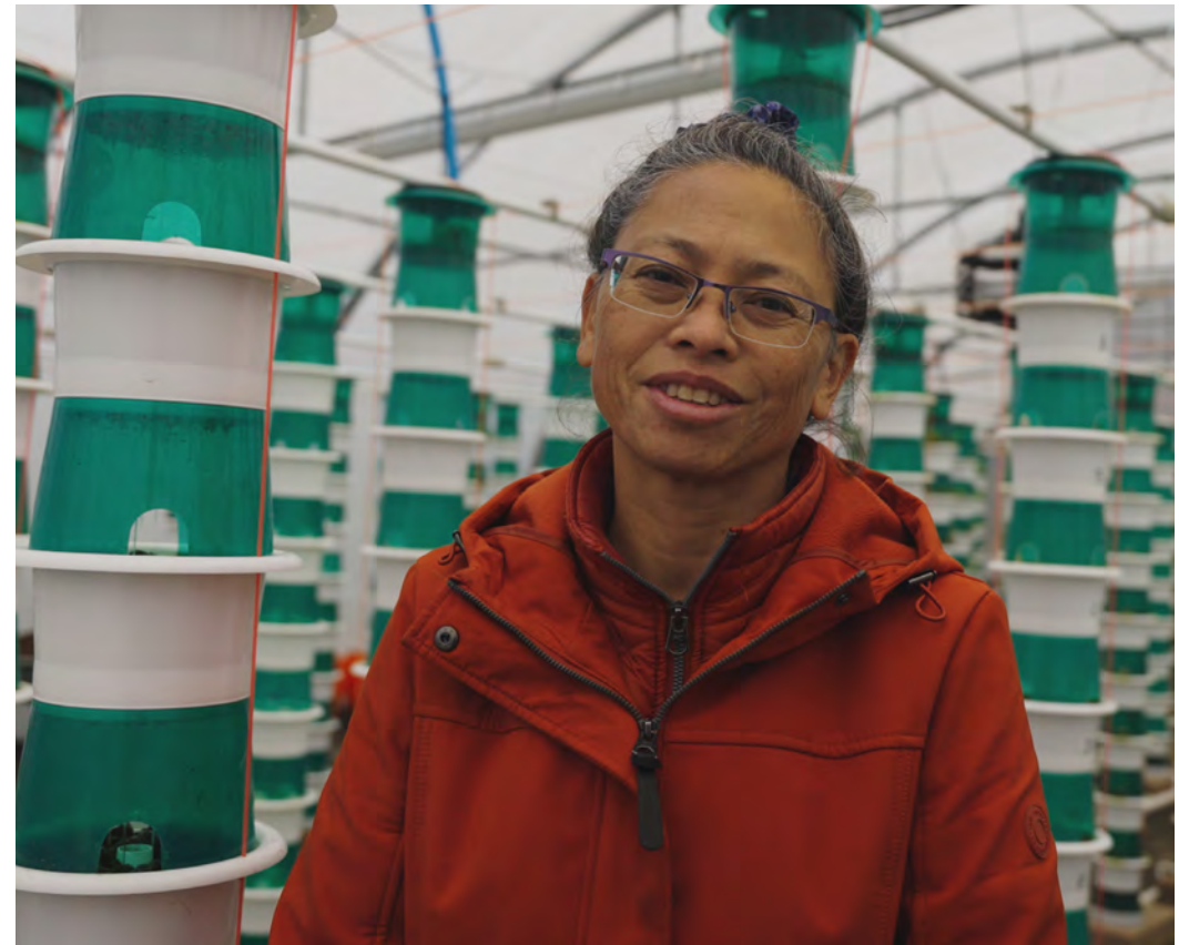
Mad Leap, supported by Future Industries Demonstrator