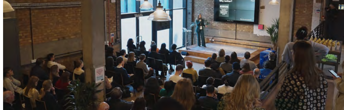
Catch22 pitching event

Whether helping businesses move from wireframes to a minimum viable product or preparing investment-ready companies for fundraising, the accelerator adapts to meet the needs of its participants. Over the past year, 33 ventures have received hands-on mentorship and the programme has cultivated over 900 members in its award-nominated online community of startup enthusiasts and industry professionals committed to ethical technology.