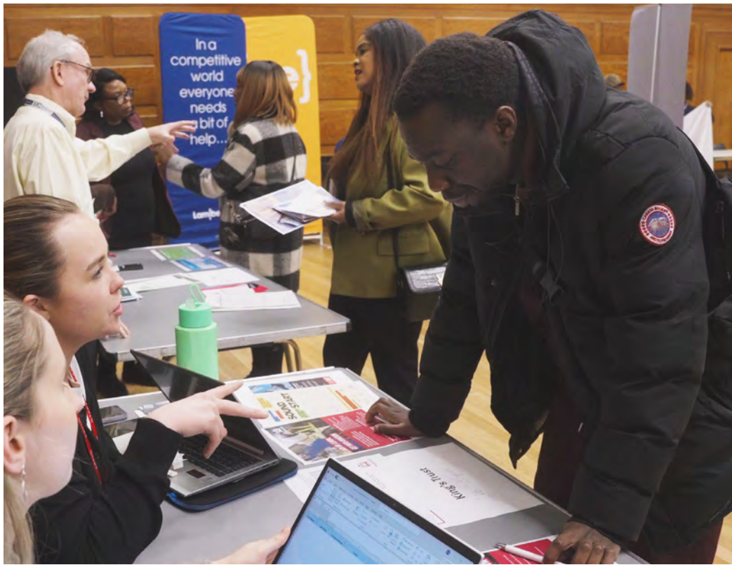
Young person at a careers fair, enabled by Unity Futures