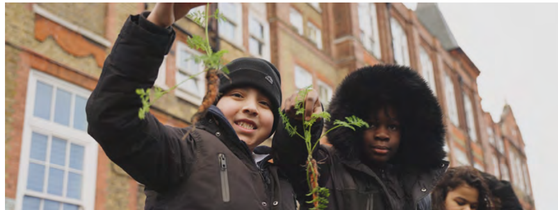
Primary school students at “Mad Leap” test-bed

In late 2024 the UK Government announced a 12-month extension to UKSPF, with £63 million being awarded to London.