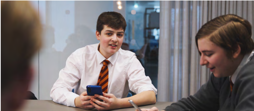
East London Careers Hub visit to Framestore