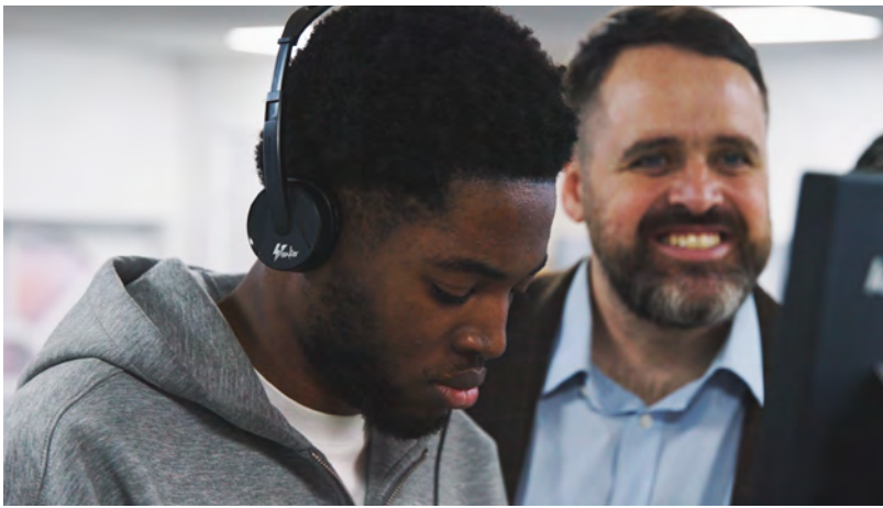
Participant at Bouncebackability, EET group