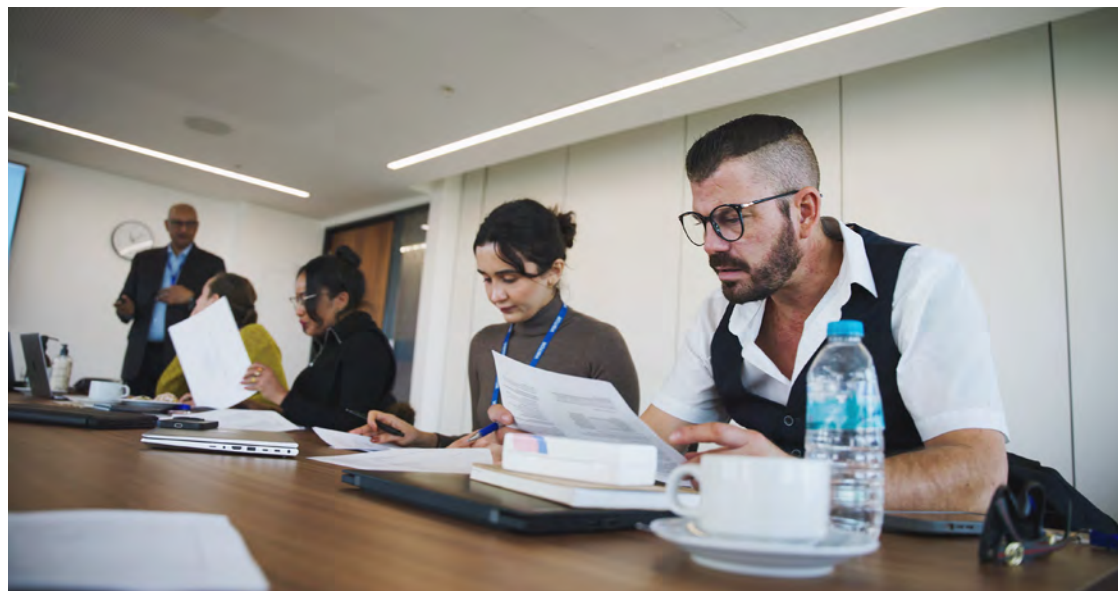
Supplier Readiness Programme workshop