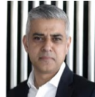
Sadiq Khan - Mayor