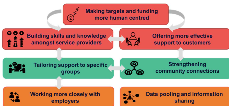
Figure 1: Opportunity areas identified in Stage 1 of the research and innovation programme