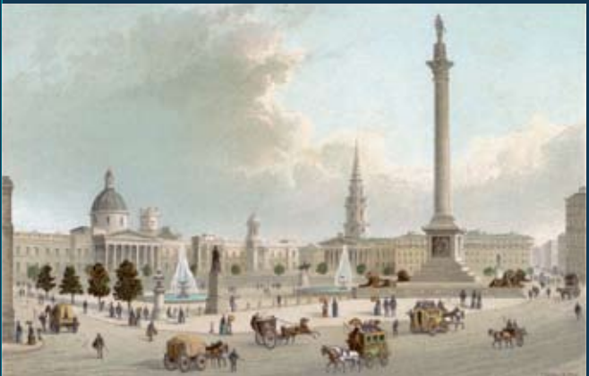
Unattributed chromolithograph, circa 1890.

In 1812, John Nash first proposed the idea of the square, as part of much wider plans for the improvement of London. From 1830 the space became known as Trafalgar Square. Parliament agreed to the building of the National Gallery in 1831, and it was completed on the north side of the square in 1837. Sir Charles Barry, architect of the Houses of Parliament, was commissioned in 1840 to design the two-level square that we know today.