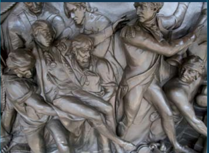
Bronze panel at the base of Nelson's Column

The restoration of the column in 2006 confirmed its total height as 51.9 metres. This measurement reflects the distance from Victory's main masthead to the quarterdeck. The four bronze panels at the base of the column were cast from captured cannon and depict some of Nelson's most famous battles. The lions were designed by Sir Edwin Landseer who took four years to finish all four lions. The lions are said to protect Nelson's Column.