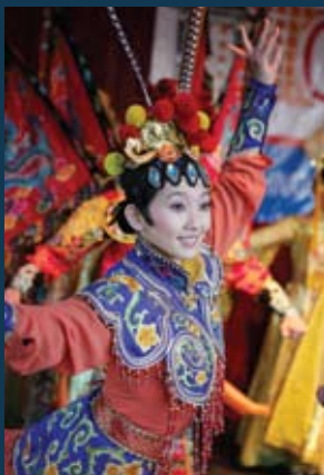
Chinese New Year.