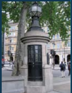
Police box.

The south-east corner of the square features what is probably the smallest police box ever built. In 1926 Scotland Yard cut out the inside of what was an old light drum and installed a light and a telephone line which the police could use to call for assistance. The box is now used for storage.