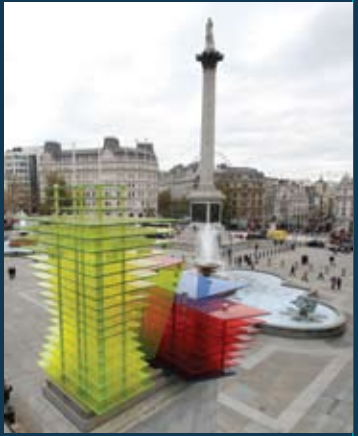
Model of a Hotel 2007

There are four plinths for statues in the square. Bronze statues stand on three of them: General Sir Charles James Napier is on the plinth in the south-west of the square, Major General Sir Henry Havelock on the south-east plinth and King George IV on the north-east plinth.