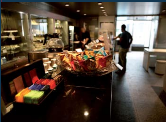
Café on the Square.

In conjunction to the events held on the Square – we will be celebrating the lead up to the festive season offering winter warmers, mulled wines, minced pies and a whole host of festive treats.