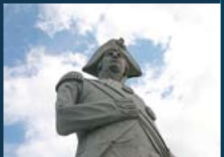
Nelson's Column

Nelson's Column was completed in 1844 and the lions at the base of the column were installed 23 years later in 1867. In 1876 the Imperial Measures were set into the north terrace wall. Surveyors can still check 'Perches', 'Chains' and other archaic measures against feet and yards. When the central staircase was added, the measures were relocated, and you can now find information about them outside the Café on the Square.